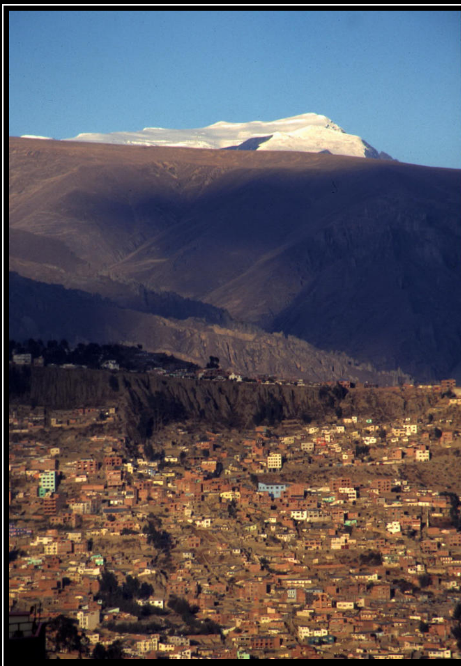
☺ Nature is more divine and more harmonious than any human marvel. ☺ View on the City of La Paz shining in the sunset, being the highest capital of the world (Bolivia) – August 1996